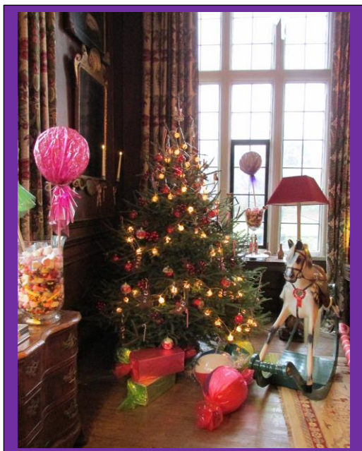
DODDINGTON HALL 'FAIRYTALE CHRISTMAS'