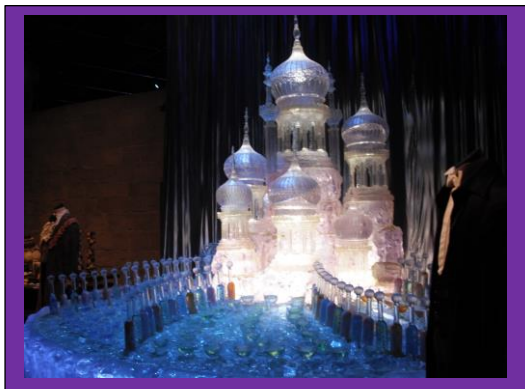
HARRY POTTER STUDIOS