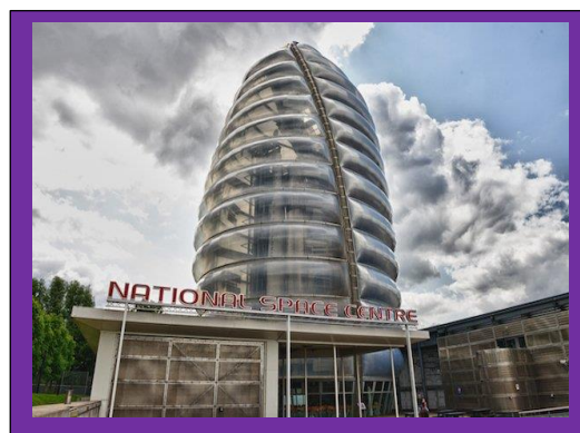
NATIONAL SPACE CENTRE, LEICESTER