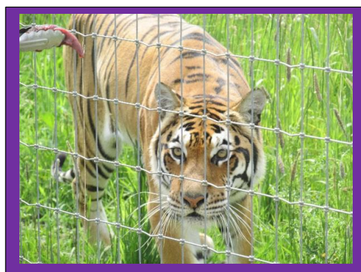
WOODSIDE WILDLIFE PARK